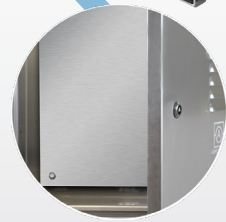
Removable Back Plate